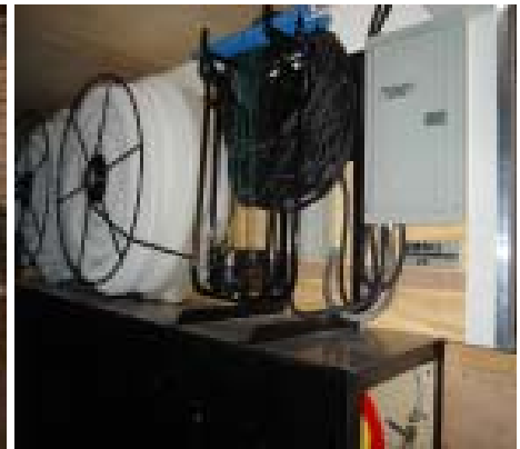
Job-Site Power Cord