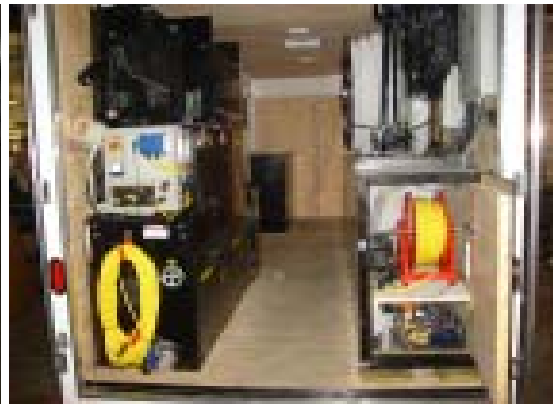
Rear View Machine & Tank Assy